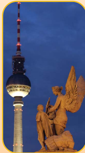
Fernsehturm Television tower